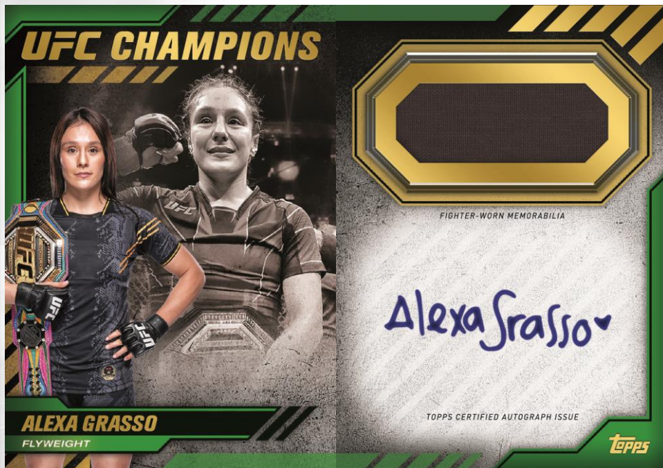
UFC Champions Autograph Relic Booklet