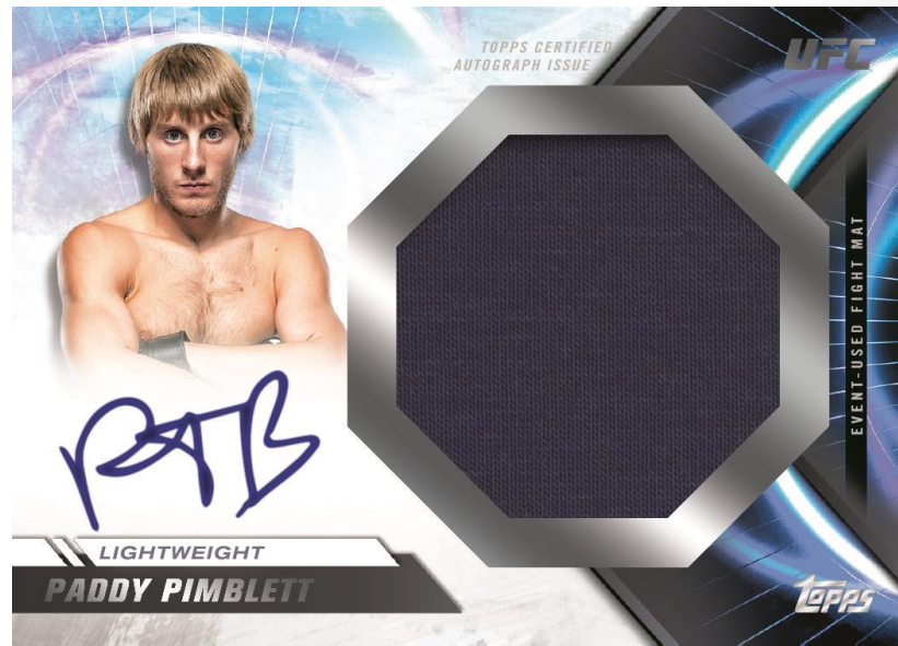
Autograph Jumbo Fight Mat Relic

Topps Knockout UFC is back! Find 4 mini boxes per master box. Look for on-card Autographs, Relic Autographs, Jumbo Relics and Booklets from your favorite UFC stars.